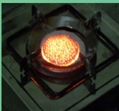
PRB for Domestic LPG Stove

Most of the commercially available medical waste incinerators (MWI) and sanitary napkin disposal units are less efficient and are mainly operated by electricity. No attempt has been made to develop incineration devices with energy efficient combustion system. Considering the prevailing Covid-19 pandemic, it is very important to develop energy efficient LPG operated portable cremation system for the safe disposal of Covid-19 infected human bodies. Further, ceramic Industries also consume huge amount of LPG / PNG for drying of tiles and other components. PRB is an ideal choice for these industries, as the PRB provides uniform radiant heating and also provides higher rate of heat transfer compared to the conventional free flame combustion burners. Initial test trials of PRB based furnace carried out at ceramic industry located in Gujarat showed a fuel saving of 40-50 % in comparison with the existing furnace. Pictorial views of the PRBs developed for various fuels and applications are given below.