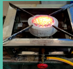
PRB for Domestic Bio-gas Stove